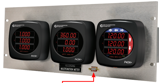
Front RS232 Port